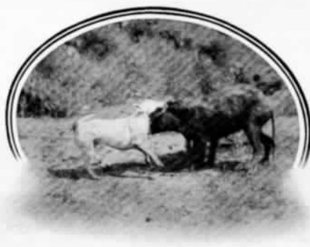
THE RIGHT SOW BY THE EAR.

I ripped the little rifle out of its case, jammed home the cartridge, and started in pursuit. The chase had turned up the barranca , and as soon as I had gone beyond the roar of the surf, I could hear Pepper's distant and excited yapping. I ran fully a half mile before I came up